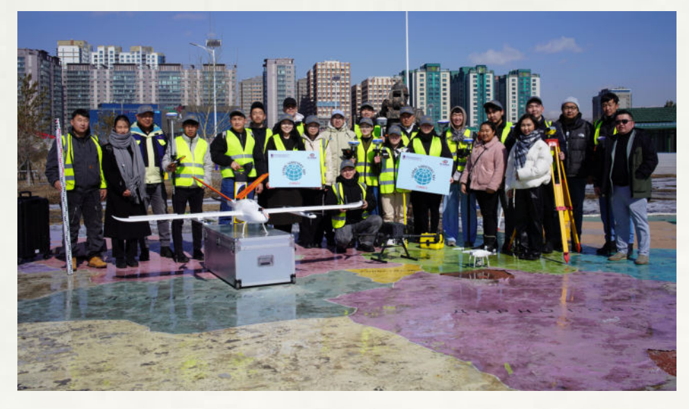
OUR COLLEAGUES IN FEILD NAMED AFTER GEODETIC ENGINEERS