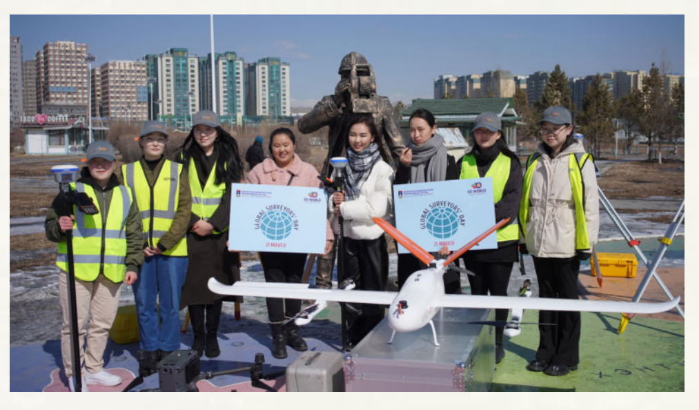
OUR COLLEAGUES IN FEILD NAMED AFTER GEODETIC ENGINEERS