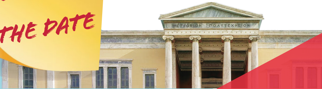
FIG JOINT CONFERENCE

A joint Conference with UNECE WPLA & REM, FIG Com 3 & FIG Com 9, EGoS, World Bank