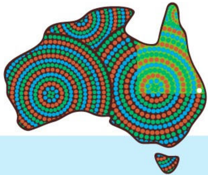
FIG Working Week 2025