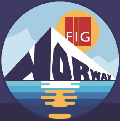
FIG Working Week 2027