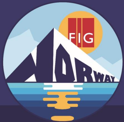
FIG Working Week 2027