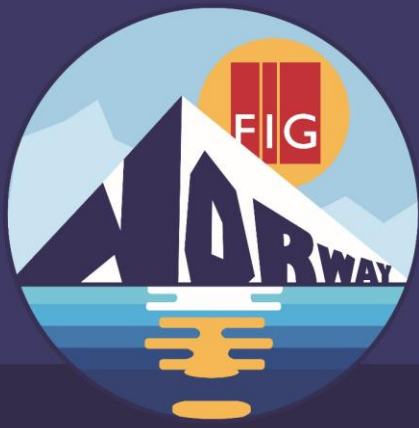
FIG Working Week 2027