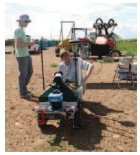
Figure 1: The authors at Jarrett's Vineyard

Biodynamic viticulture rejects the use of synthetic chemical fertilisers and pesticides. Both organic and biodynamic farming practices embrace the use of natural products, but the underlying philosophy of biodynamics is the use of soil and plant 'preparations' to stimulate the soil and enhance plant health and product quality (Reeve et al., 2005). The adoption of organic and/ or biodynamic farming practices is likely to increase with greater awareness of climate change and sustainability requirements (Turinek et al., 2009). The general thesis of these farming processes is sustainable agriculture, with no long term environmental damage. There remain a number of research gaps in organic and biodynamic farming practices - for example, critics cite a lack of scientific understanding and rigour within the biodynamic field (Kirchmann, 1994). PV technology has a role to assist, for example in research on soil nutrient variability, mapping and management, weed control, and achieving dual outcomes of economic