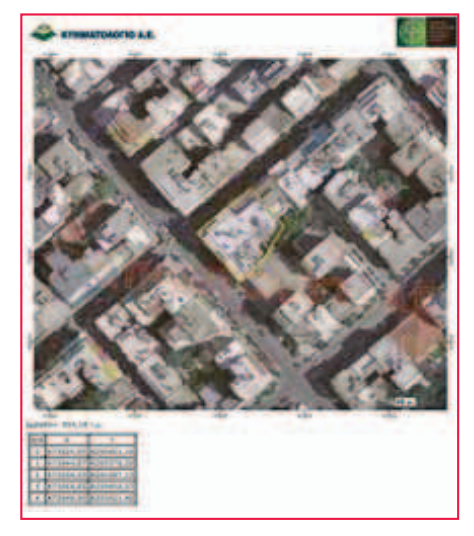
Figure 5: The interim cadastral map derived online