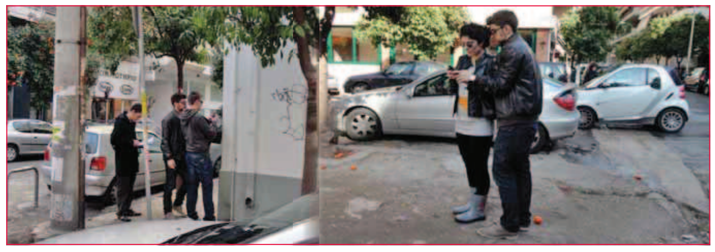
Figure 6: The volunteers at the urban area

and to S. Soile, Surveyor Engineer at the Laboratory of Photogrammetry of NTUA for her technical support and K. Apostolopoulos, undergraduate student of NTUA who helped in the implementation of the second experiment.