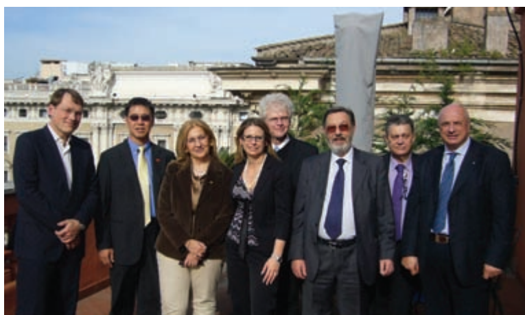
FIG, FAO and CNGeGL representatives at the balcony of CNGeGL in Rome preparing the programme for FIG 2012

The overall theme for FIG during the current four-year term of office is "Engaging the Challenge: Enhancing the Relevance". The three key pillars are: Engaging the Membership; Engaging Global Challenges; and Enhancing the Relevance of the Profession. The surveying profession continues the race to the top as FIG seeks opportunities to