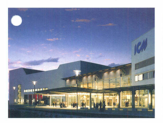
Trade Fair with more than five hundred exhibitors, opening ceremony, plenary and technical sessions to be held at the International Congress Centre Munich (ICM).