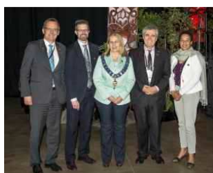
The new FIG Council

The FIG General Assembly was held 02 and 06 May in Christchurch, New Zealand in conjunction to the FIG Working Week 2016. The main issues on the agenda were the election of two FIG Vice Presidents for the term 2017-2020 and the venue for FIG Working Week 2020. 55 Member Associations and several observers attended the FIG General Assembly 2016. General Assembly report: