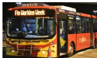
FIG Working Week 2016 was organised in Christchurch, New Zealand 2-6 May 2016 and attracted more than 700 participants from 65 countries. The Working Week offered a lot of various activities, sessions, pre-workshops and meetings during the busy week.

We are now - not recovering from disaster - but from a large and different Working Week success!