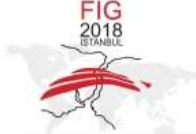
FIG Congress 2018

For additional FIG and FIG Commission events see always up-to-date information at: www.fig.net/events/index.asp