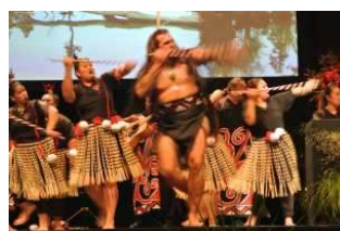
A traditional Maori dance

www.fig.net/resources/proceedings/fig_proceedings/fig2016/index.htm