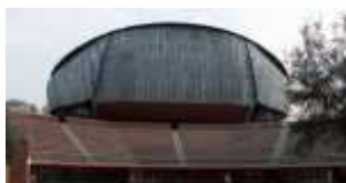
The impressive building "Parco della Musica" where the opening ceremony as well as concert will take place.