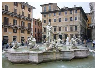
Piazza Navona in Rome

FIG Working Week 2012 " Knowing to manage the territory, protect the environment, evaluate the cultural heritage " will be held in Rome 6-10 May 2012 at the Rome Cavalieri Hotel. We expect more than 1,200 participants from 100 countries to attend this main FIG conference next year. The conference is organised by Consiglio Nazionale Geometri e Geometri Laureati (CNGGL) and FIG. The main partner is FAO.