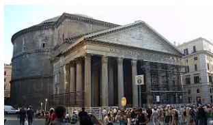
The Pantheon in Rome

FIG Working Week 2012 " Knowing to manage the territory, protect the environment, evaluate the cultural heritage " will be held in Rome 6-10 May 2012 at the Rome Cavalieri Hotel. We expect more than 1,200 participants from 100 countries to attend this main FIG conference next year. The conference is organised by Consiglio Nazionale Geometri e Geometri Laureati (CNGGL) and FIG. The main partner is FAO.