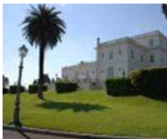
Villa Miani - the venue for the Gala Dinner.