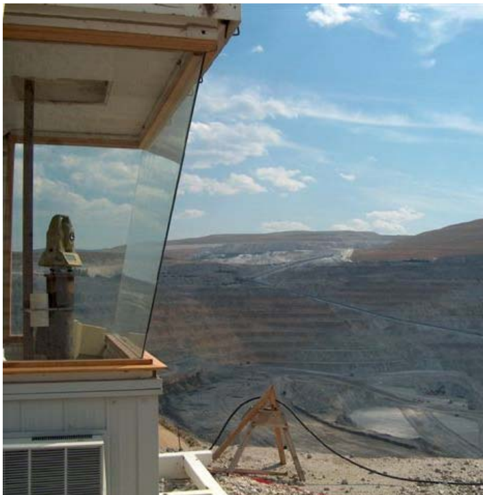
Fig 1 Typical view from an RTS shelter

The SA copper mining operation consists of several open pit mines at an elevation of approximately 3000 m above sea level. The largest of these pits has approximate dimensions of 2.5 km x 3.5 km (at the rim) with a depth of 1000 m. The area is very arid, with very predictable weather conditions of more than 300 sun days per year with an annual temperature ranges of about 3 0 C to 28 0 C with maximum day/night differences of about 15C 0 . The monitoring system at this pit consists of several RTS instruments (Leica TCA 1800, TCA 2003, and TCA 1201) located at strategic locations on the rim and at various elevations within the pit. All of these instruments are connected, controlled, and supported by the ALERT software system.