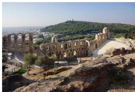
Pierrot Heritier photos