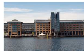
Complex housing the FIG Office, Copenhagen