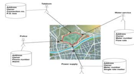
GIS in local community environment