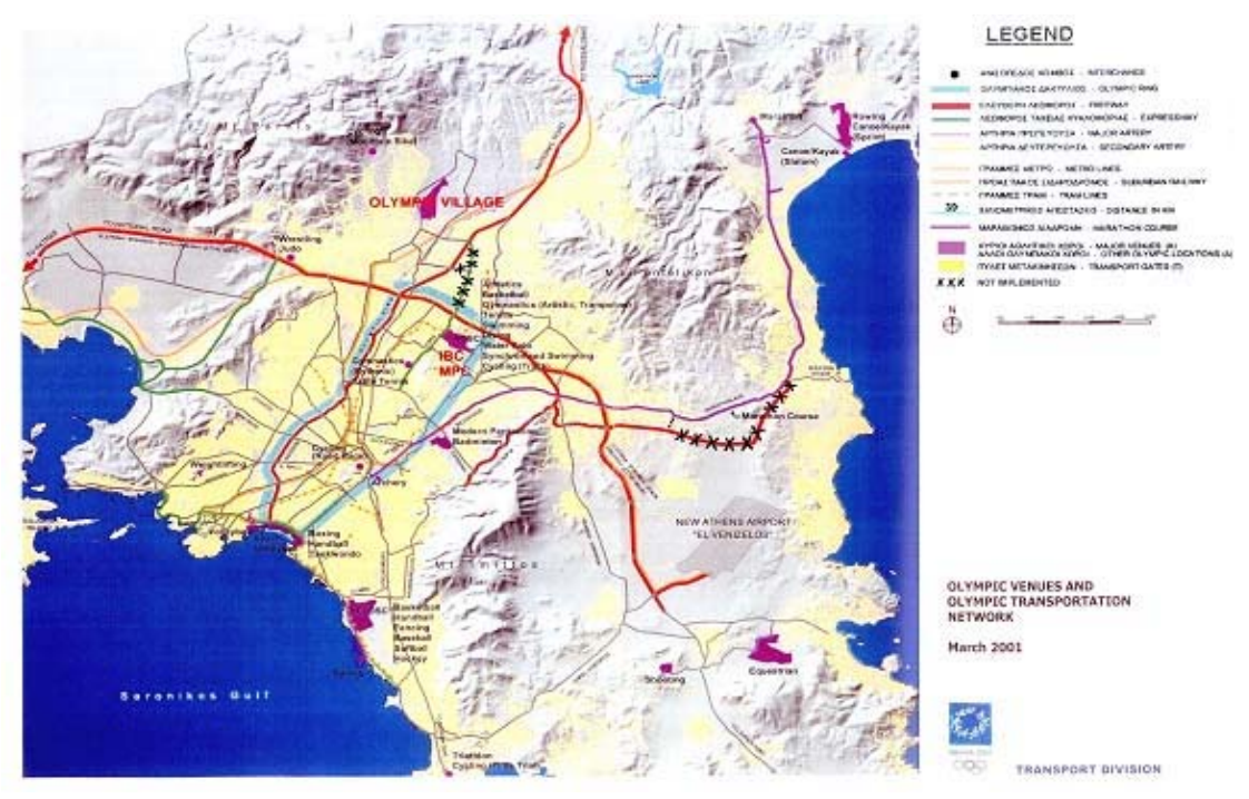
Figure 2. Olympic venues and Olympic transportation network