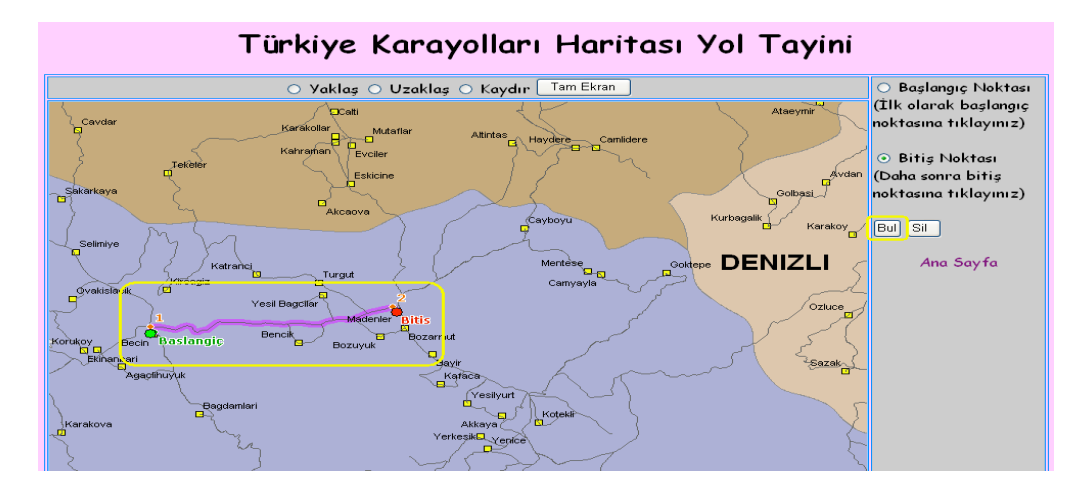
Figure 3: Finding Shortest Road Page

The shortest directions between two routing objects can be obtained by selecting a starting and ending point (Figure 3). The detailed maps involved the proper route with the information of distances and times are written to a table at the bottom of the page (Figure 4). The shortest and the quickest paths can be found with AspMap. In this study the shortest path is selected for application. Finding the shortest path in AspMap is done by Dijkstra's Algorithm used commonly in geographical information systems and also in designing the computer networks ( Zhan, F. B., and Noon, C. E., 1996 ). Although it does not work with the negative values, it is known that this algorithm is the fastest one compared to the other algorithms used for solving this problem.