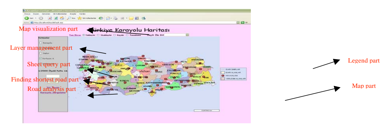
Figure 1: Interactive map web page

The components of ArcGIS Desktop 9.1 version (ArcMap, ArcCatalog and ArcToolbox) are used during the process of data visualization and preparation of database ( ESRI, 2002 ). The outcome is presented on the internet by using ASP technology on client/server architecture. The developed web page that can be accessed by the users and shown in Figure 1 has some parts for making some analysis or assisting to visualize the map. These parts can be entitle as layer management part, map part, map visualization part, legend part, sheet query part, road analysis part and finally finding shortest road part.