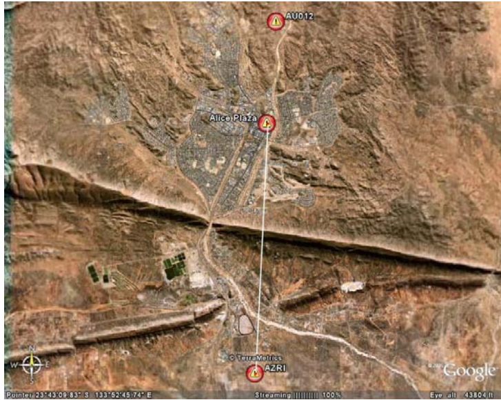
FIG Working Week STOCKHOLM June 2008

NT Government DEPARTMENT OF PLANNING AND INFRASTRUCTURE