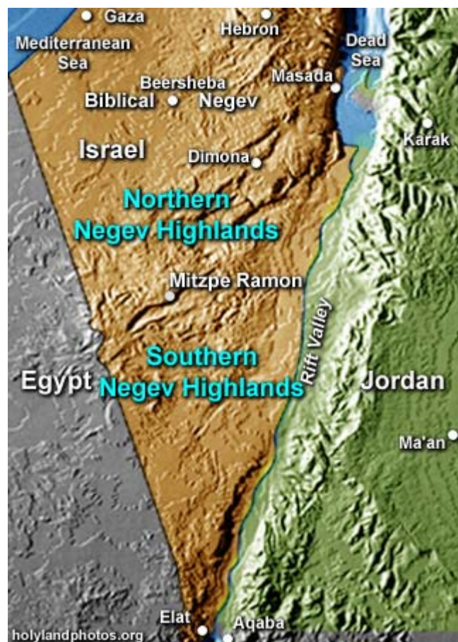
Figure 1. Negev Desert Region.

The implementation of coordinate based cadastre project is carried out in the Negev Desert region spreading on approximately 50% of the territory of the State of Israel, (see Figure 1) and inhabited by 550,000 residents. The origin of the word "Negev" is from the Hebrew root denoting "dry". In the Bible the word Negev is also used for the direction "south". Contrary to the usual view of a "desert," the Negev is not covered with sand. Rather, it is a mélange of brown, rocky, dusty mountains interrupted by wadis (dry riverbeds that bloom briefly after rain), and deep craters.