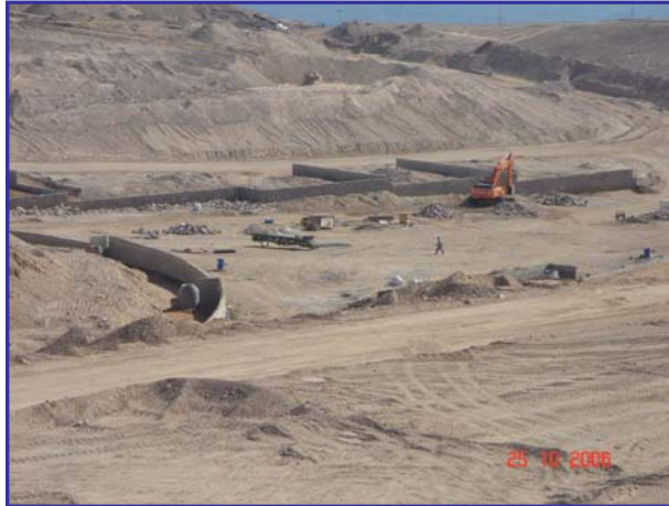
Eilat 2009, FIG Working Week