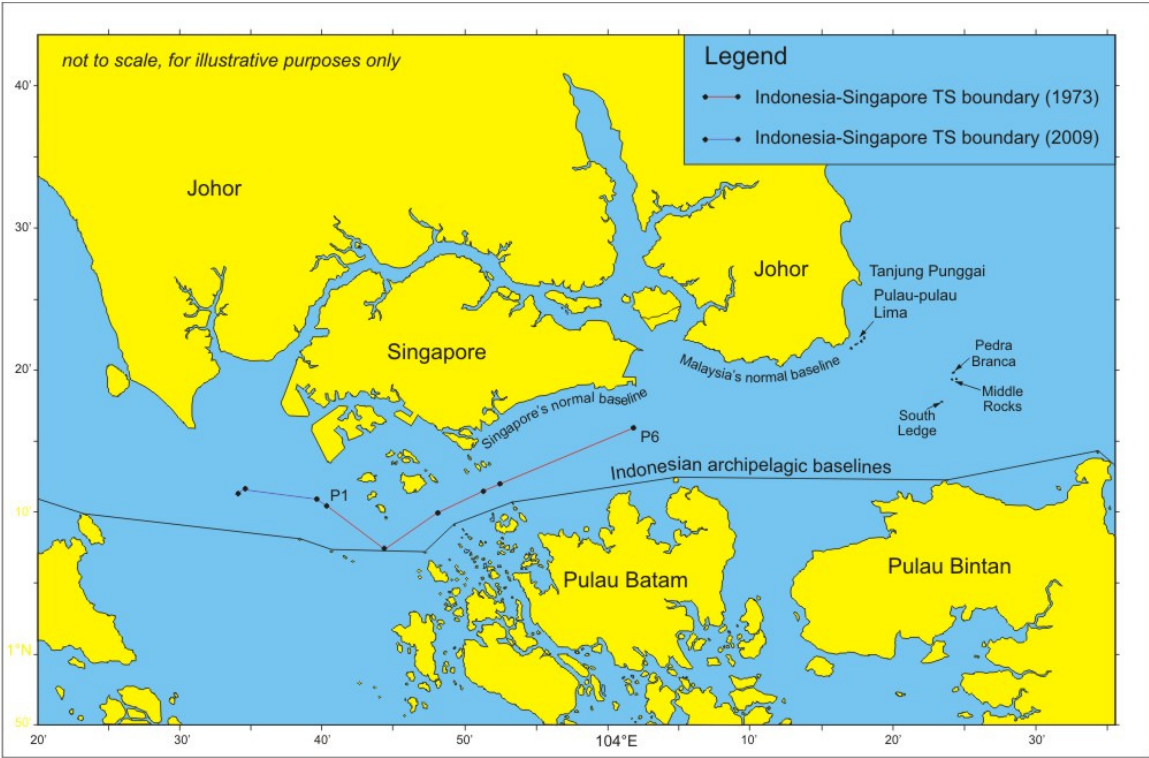
Figure 2 Singapore Strait – baselines, basepoints and islands/rocks

Similar case for Malaysia, it uses normal baselines because it is not an archipelagic State and has never officially published any other type of baselines. Its normal baselines are along the coastline of Johor and also several small islands in the vicinity of Johor. Malaysia can also use MR as a new basepoint as it has been awarded to Malaysia by ICJ. Geographically speaking, MR may have a significant role in maritime delimitation between Singapore and Indonesia, and also for territorial sea delimitation between Malaysia and Singapore around PB and MR. Figure 2 illustrates relevant baselines in the delimitation of maritime boundary in the Singapore Strait and three geographical features.