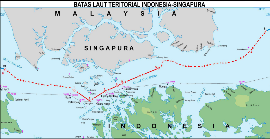
Figure 3 Tentative territorial sea boundary in the Singapore Strait according to Peta NKRI 2009

As in the case of MR, it might be reasonably acceptable to consider it as a rock that is still entitled to a territorial sea. In delimiting maritime boundaries between Malaysia and Indonesia to the south of MR, Indonesia might view that the small rock should not be given full effect, while it maintains the use of archipelagic baselines. Meanwhile, it does not matter which State will be awarded SL (either Malaysia or Singapore), it is a low tide elevation, to which Indonesia may prefer not to give full effect in maritime delimitation. This view is confirmed by tentative maritime boundary lines in the Singapore Strait depicted in Peta NKRI 2009. It seems that the boundary line has been constructed by giving PB, MR and SL only very limited weight. However, it is not easy to quantify accurately the effect/weight given to them, provided that the scale of Peta NKRI 2009 is too small for such analysis. The map does not even show where MR and SL are (see Figure 3).