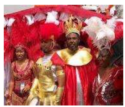
Nollyhood artistes at the Carnival