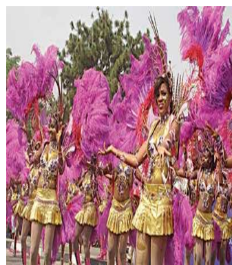
Clips of 2011 Calabar Carnival Street Party