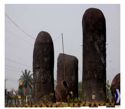
Ikom Monolith, part of the attraction