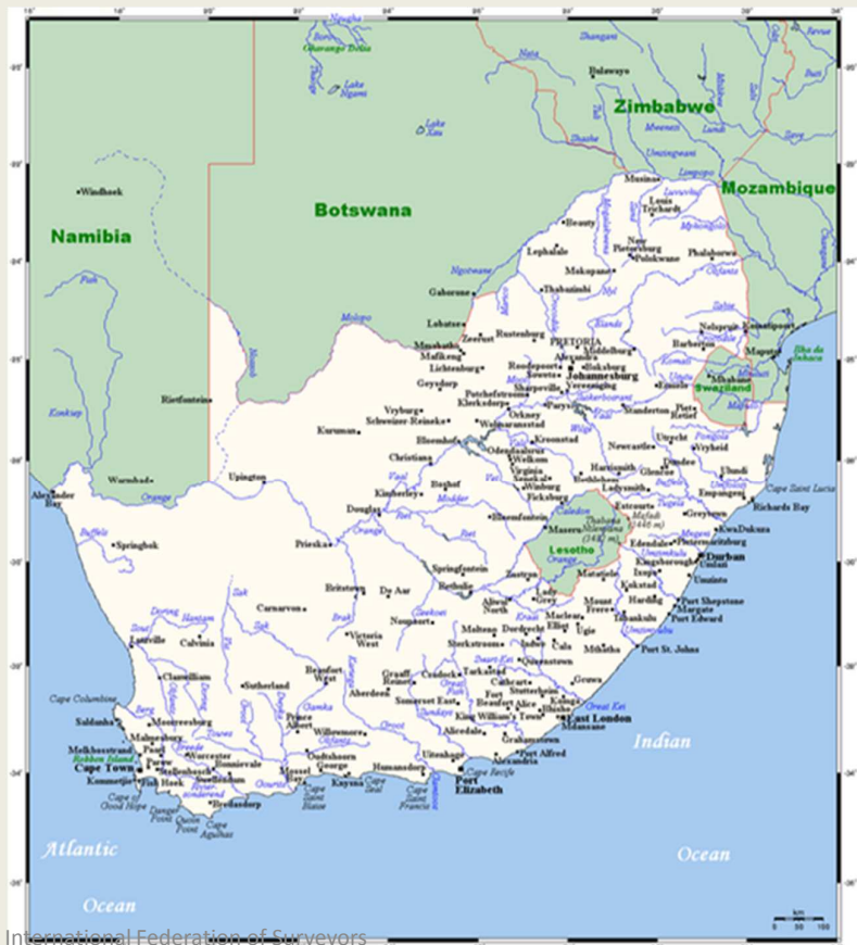
XXV International Federation of Surveyors Congress, Kuala Lumpur, Malaysia, 16 – 21 June 2014

Several small rivers run into the sea along the but none is navigable and none provides useful natural harbors. The coastline itself, being fairly smooth, provides only two good natural harbours,