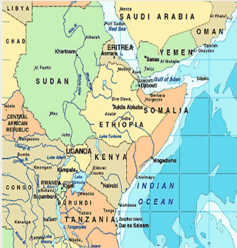
XXV International Federation of Surveyors Congress, Kuala Lumpur, Malaysia, 16 – 21 June 2014

And the last sub region is the Indian Ocean islands of Comoros and Seychelles.