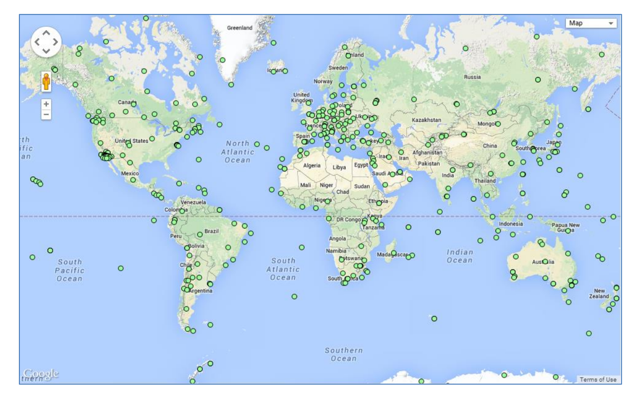
Fig 1. IGS GNSS-Receiver Tracking Network