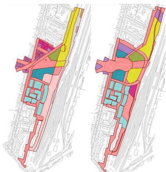
Figure 3: Proposal for Urban Land Readjustment in one of the 12 pilot cases. Shown left: ownership before reallocation, shown right: ownership after reallocation (Van der Stoep e.a., 2013).

After the pilot program the minister establishes a commission for Urban Land Readjustment. This commission has to give advice to the minister which kind of legal rules are necessary for successful urban land readjustment.