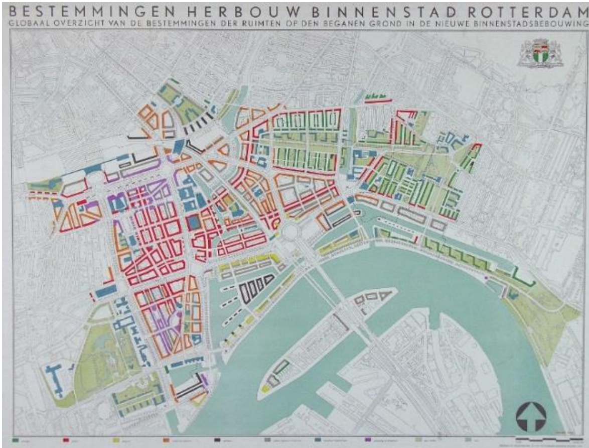
Figure 1: Base Plan for the reconstruction of Rotterdam

Despite the initial enthusiastic reception of Witteveen's plan, some resistance gradually began to surface. In 1944 a new plan was made, the Base Plan of Rotterdam. The city centre of Rotterdam was extended towards the west, a new road infrastructure was planned and different functions, such as housing, working and shopping were mixed up. The base plan was intended to be flexible and functioned more than 40 years, until 1984.