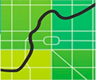
FIG Working Week 2016