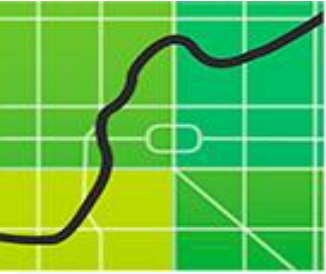
FIG Working Week 2016