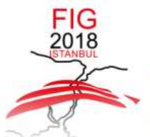
FIG Congress 2018