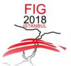
FIG Congress 2018