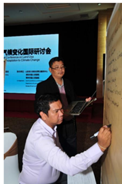
Photos: Participants working in a group