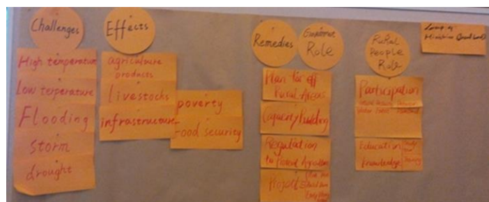
Photos: Presentation of findings