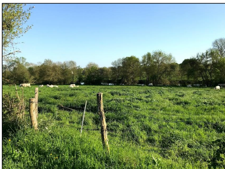
Figure 3: Meadows in the Oudon bottom valleys/Segré en Anjou

In France, local authorities and river syndicate on the Oudon river basin were pilot in the implementation of this new type of public utility easement. In the beginning of the 2000s, after several major floods and major damages on hundreds of houses, they decided to create flood storage areas; in their project, they quickly faced the land tenure issue. Two options were considered: land acquisition or the implementation of a new procedure, the over-flooding easement. As explained during our interviews, local authorities decided to choose the latter, in order to avoid/limit conflicts with farmers.