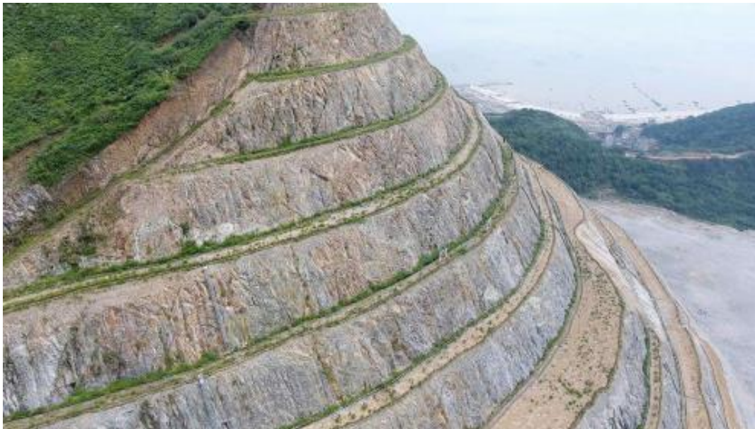
A typical mine side slope is shown as following

The slopes formed after excavation in open pit mines are usually rocky slopes where large volumes of rock are as a result of the stripping of large volumes of rock, the stress balance of the original rock is disrupted and the residual slope is relieved and tends to rebalance. During the process of re-equilibration, the slope is subject to stress deformation, which may result in rock fracture, crumbling, and possible slope instability resulting in collapse or landslide.