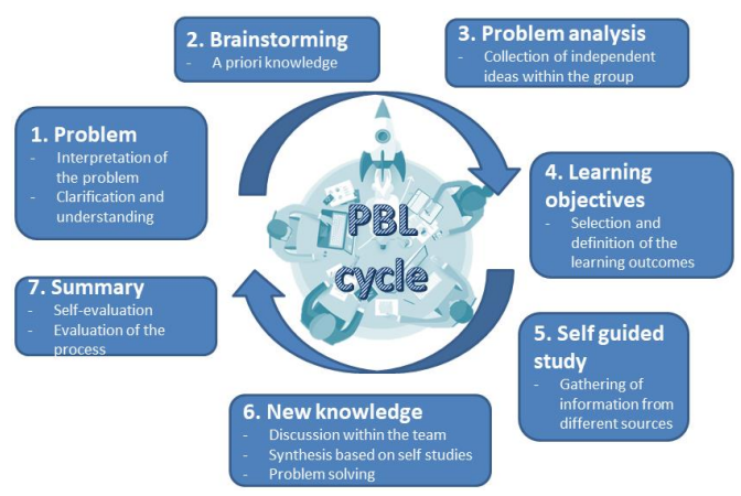
Figure 1. PBL cycle (from Retscher et al., 2022).

presented with a problem or choose a real-world problem themselves. Subsequently, this problem is defined and clarified, then students can think about how they would solve a problem based on the knowledge they already have from their previous studies (i.e., a priori knowledge). In the third step, the students collect the a priori knowledge from all members of the group and analyse the problem. Definition of learning objectives is an important step in which the students have to define the knowledge they are missing in order to solve the problem. This is an important step in creating life-long learners because they have to be self-aware and demonstrate their critical thinking skills. Following the definition of the learning objectives, the students engage in a self-directed study where they gather materials from different sources. Students can use diverse materials from different disciplines such as books, videos, journal and conference articles, forums, online discussions and interviews with stakeholders and experts from multiple fields. Teachers are there for students across all these steps to moderate discussions, guide the students and facilitate learning. In the final steps of the PBL cycle, the students synthesise all the acquired knowledge to solve the problem, which they then present to everyone.