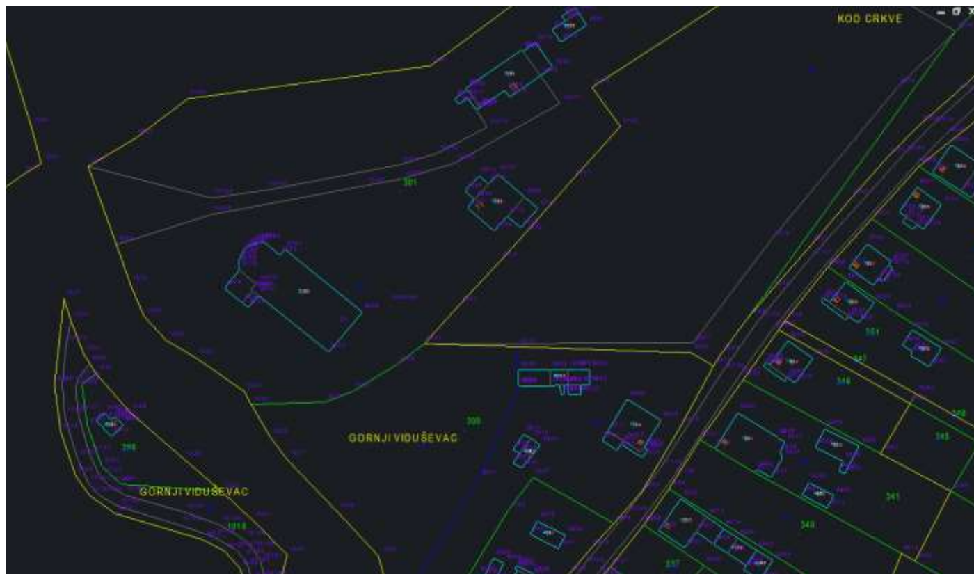
The cadastral map produced in new cadastral survey - cadastral municipality Viduševac (Croatia)