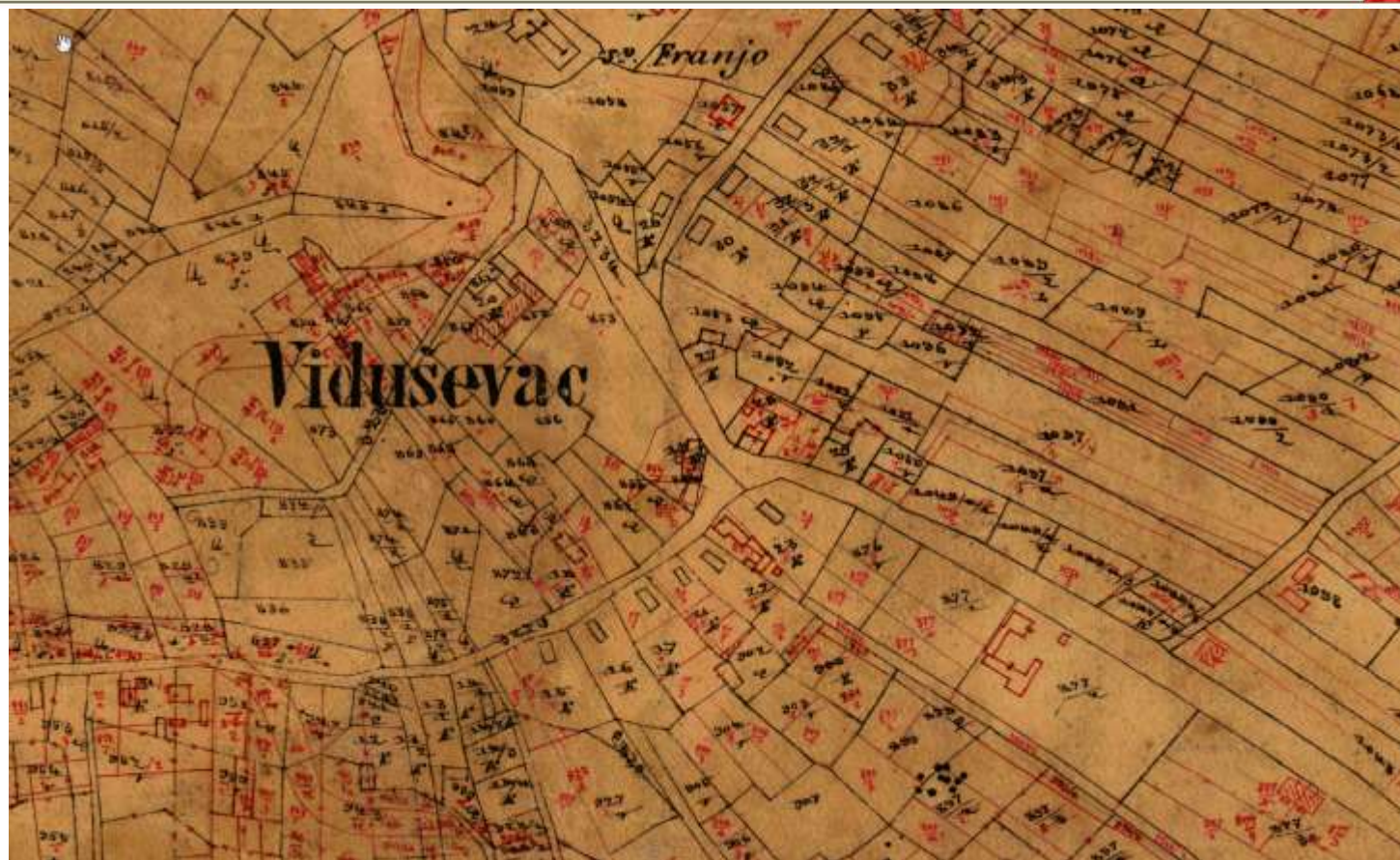
Old cadastral map - cadastral municipality Viduševac (used until 2010)