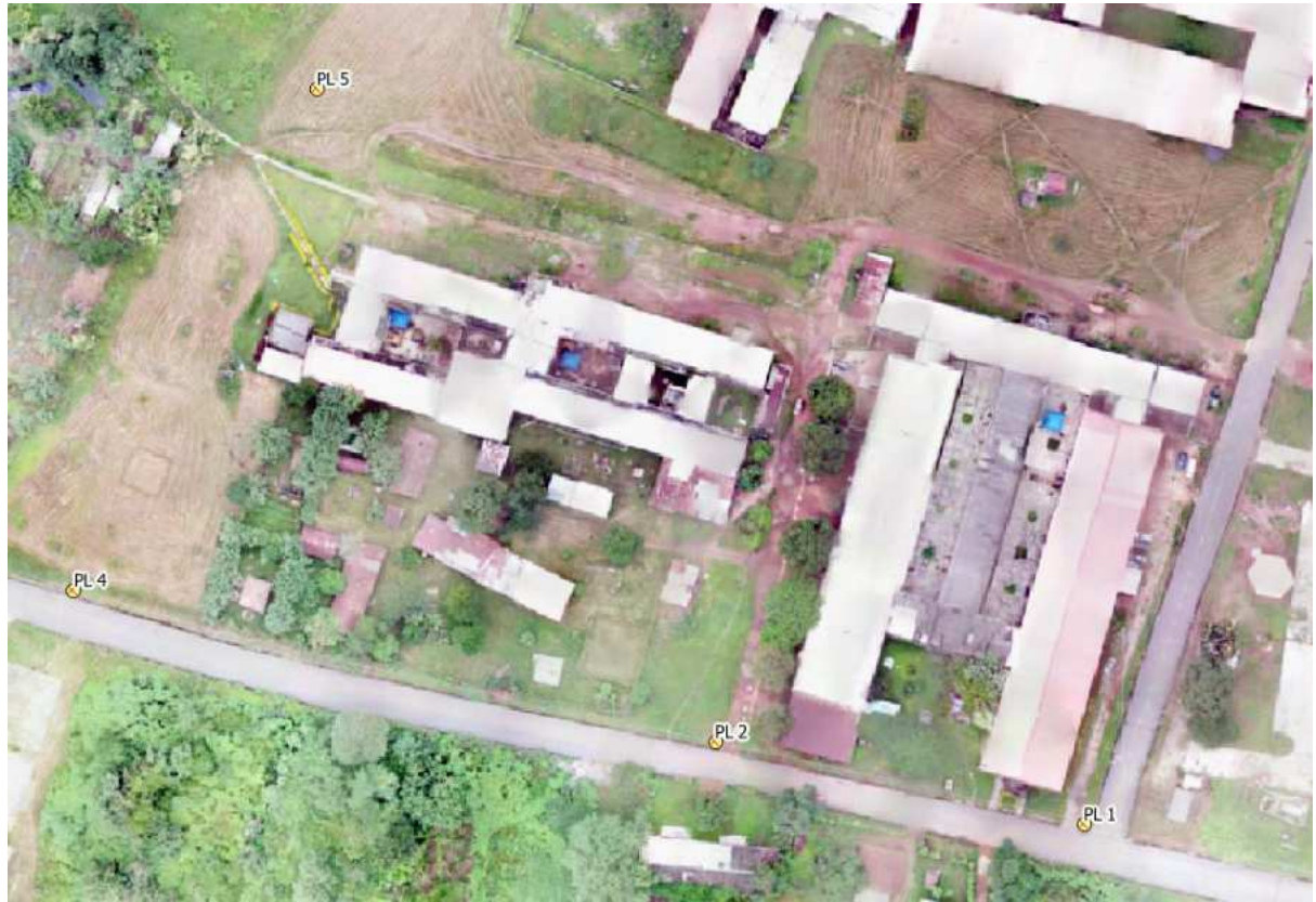
Figure 2.0 Sample Orthophoto showing comparison points for the Old School of Engineering Area