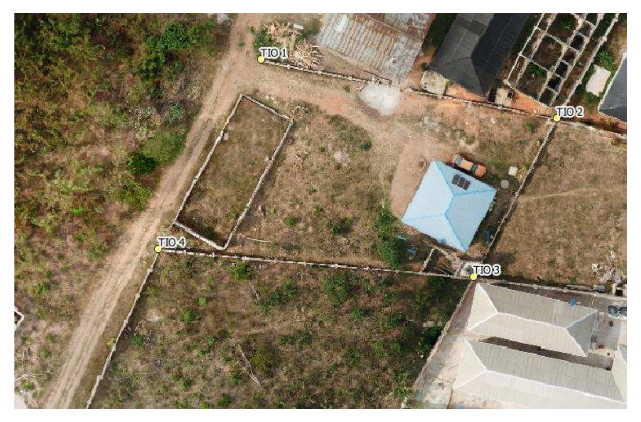
Figure 3.0: Sample Orthophoto Showing comparison points for Toluwani Bakery