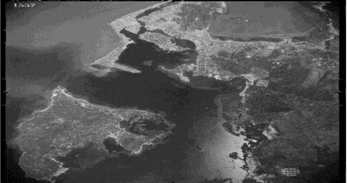
Figure 4. Cartagena Aerial Photography (1954).

The historic city of Cartagena de Indias is one of the most important cities on the Atlantic coast of Colombia, and is a historical, tourist and cultural reference point for the region.