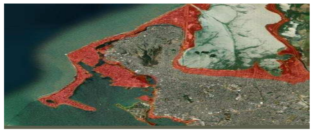
Figure 3. Planet scope image with SLR scenario (2100).

CO2 is the most studied variable to understand the climate change in the region. From the perspective of millions of years, climate changes triggered by volcanism or anoxic events can be similar to current climate change due to the modification of greenhouse gas concentrations, but with the difference of origin and speed in which it is evidenced as the cost erosion or melting of tropical glaciers, we will now look at how it can impact in the specific case of Cartagena (Bolivar) the rise in the average sea level.