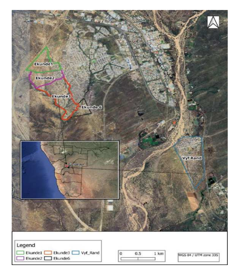
Figure 1: The selected informal settlements in Okahandja

Land Information in Informal Settlement Upgrading: the Social Tenure Domain Model as an Empowerment Tool in Okahandja, Namibia (12634)