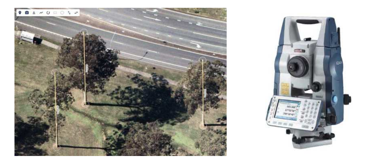
Figure 1. Measuring urban tree heights on the screen using Nearmap © oblique imagery (left) and the Sokkia Set3x reflector-less total station.