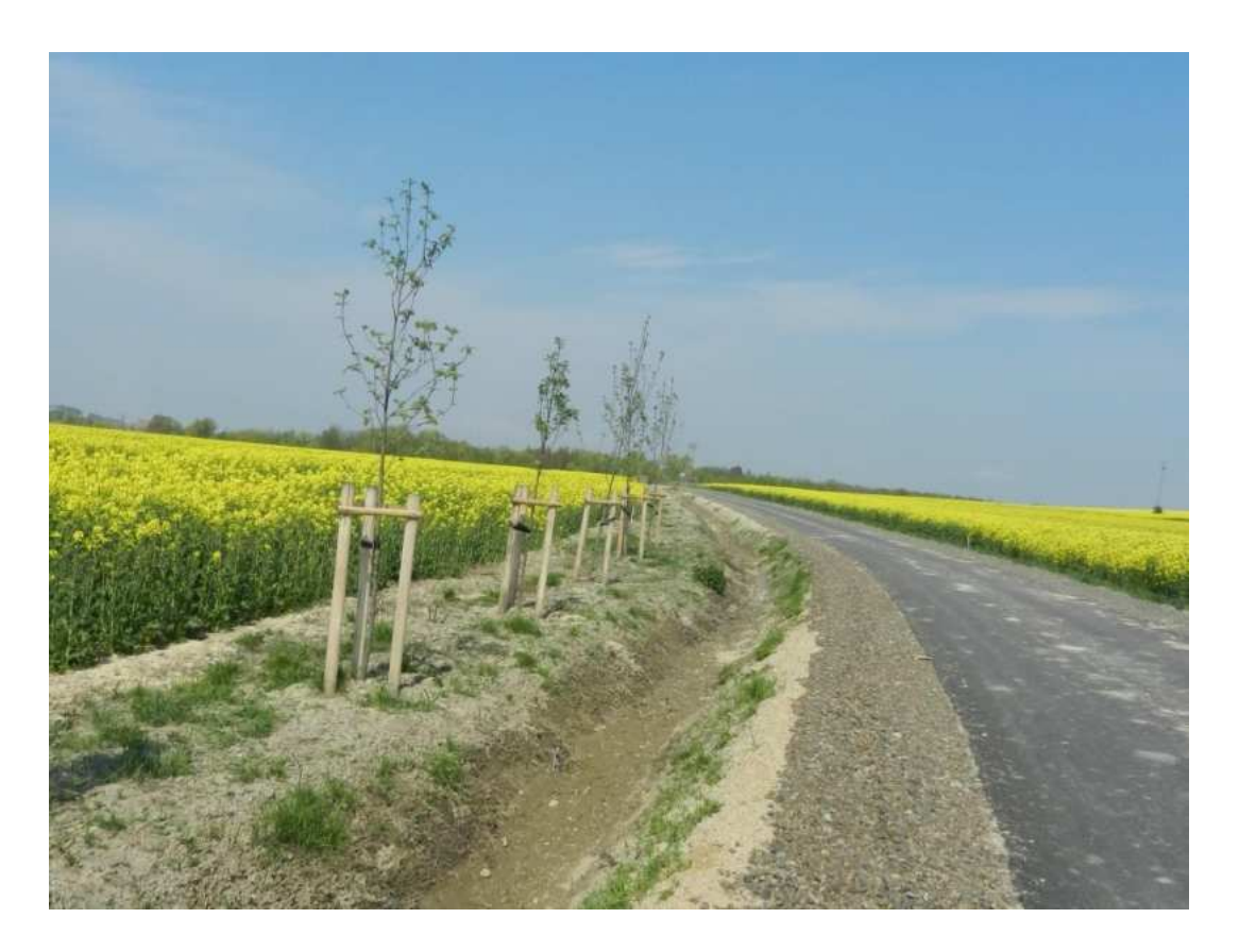
Fig. 3. Example of planting newly designed tree as part of post LC development in the village of Prusice in the Lower Silesian voivodship in Poland

In Poland, new opportunities for the introduction of NbS are provided by the Strategic Plan for the Common Agricultural Policy 2023-2027, which, under intervention I.10.8 "Land consolidation with post-consolidation development", provides project selection criteria concerning, in particular: