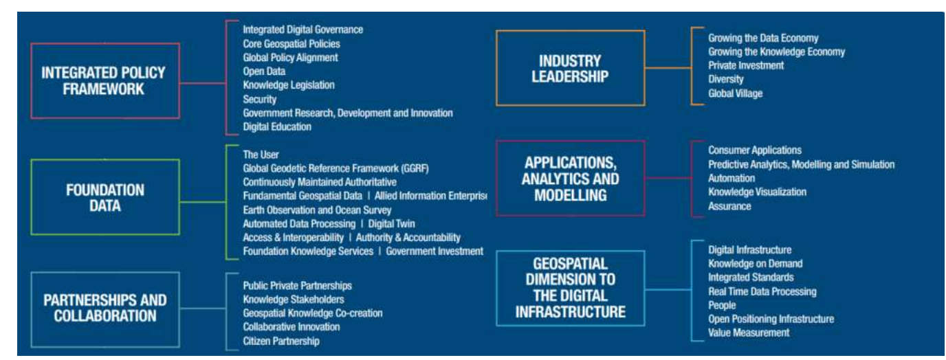
Figure 2: Initiatives associated with the seven principles of GKI. Adopted from Geospatial World & UN Statistics Division 2021

as shown in figure 2, there are associated initiatives that contribute and promote the key principles and goals of the GKI.