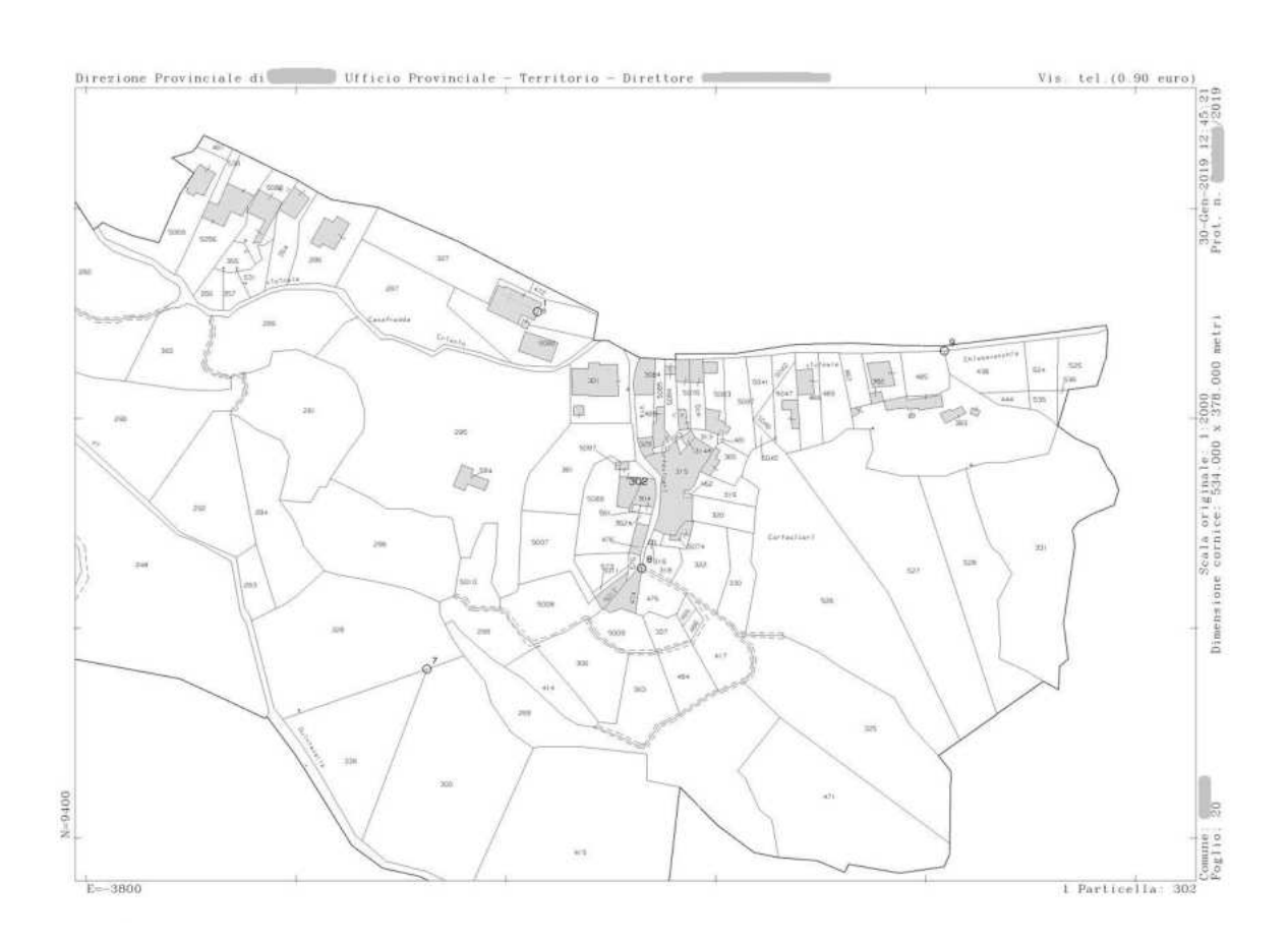
1.2 The Procedure Evolution (LAND)