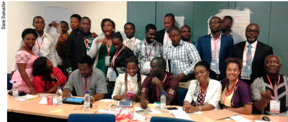
Young Surveyor workshop participants at ARN 2016.

The group's video messages can be viewed at the ARN web site http://www.fig.net/organisation/networks/capacity_development/africa/events/2016_abidjan/index.asp .