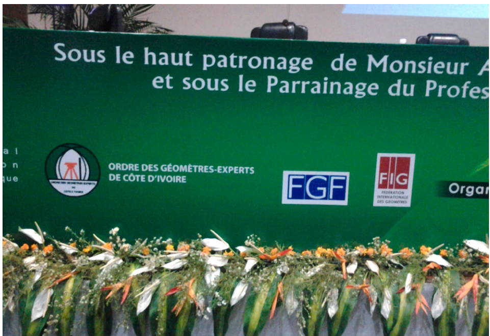
FGF and ARN conference Banner.