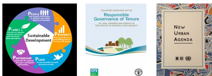
The wider global agenda of the SDGs, the VGGTs and the NUA is addressed respectively in the three workshops.

The SDGs and the wider land governance agenda will never be achieved without having good land governance and well-functioning countrywide land administration systems in place. This directly points to the land professional and their societally responsibilities