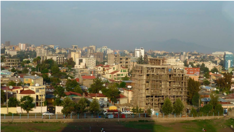
A view from Addis Ababa, Ethiopia.

The engagement strategies are further considered at the 2018 roundtable meeting held during the FIG Congress week, Istanbul, Turkey, and reported at http://www.fig.net/organisation/networks/capacity_development/africa/events/2017 .