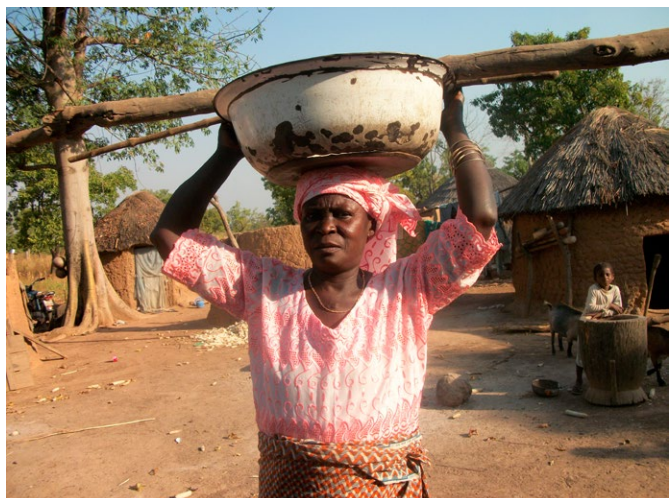
A woman farmer from Northern Ghana.