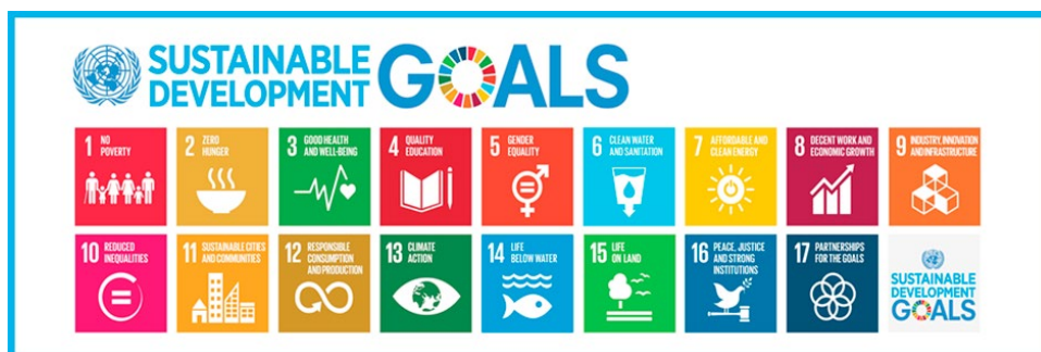
17 Sustainable Development Goals.

Diversity and working across the workplace generations is of utmost importance. This requires a network that is inclusive, collaborative, communicative and diverse. This has formed the mode of operations during the current term (2015–18).