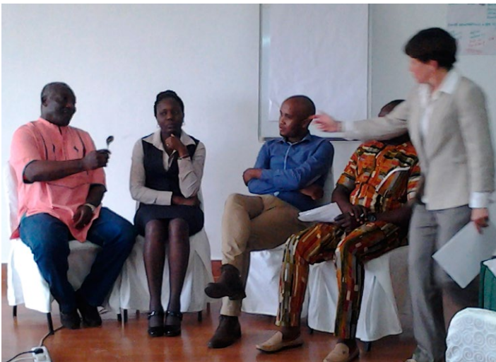
ARN Workshop participants.