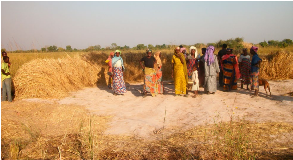
Women on their Farm.

The ARN workshop brought together 39 land professionals over the 2 day workshop, participants were drawn from several Anglophone and Francophone African nations with expertise across the range of land professional disciplines within FIG membership.