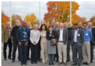
The participants at the 2nd CoFLAS expert meeting

The objective of the CoFLAS project is to develop a useful and practical tool whereby the costing and financing of land administration services in developing countries can be reformed and modernized with a view to enabling the agencies provide cost effective, efficient, sustainable and affordable services. A second Expert Group Meeting (EGM) was hosted by Lantmäteriet at its premises in Gävle, Sweden on 14-15 October 2013 attended by 20 experts. www.fig.net/news/news_2013/GLTN_Gavle_workshop.htm