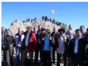
Participants visiting the Construction Lower Inn Valley Railway Site