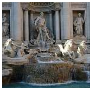
FIG Working Week 2012 "Knowing to manage the territory, protect the environment, evaluate the cultural heritage" will be held in Rome 6-10 May 2012 at the Rome Cavalieri Hotel. We expect more than 1,200 participants from 100 countries to attend this main FIG conference next year. The conference is organised by Consiglio Nazionale Geometri e Geometri Laureati (CNGGL) and FIG. The main partner is FAO.

In connection to the FIG Working Week FIG will organize: