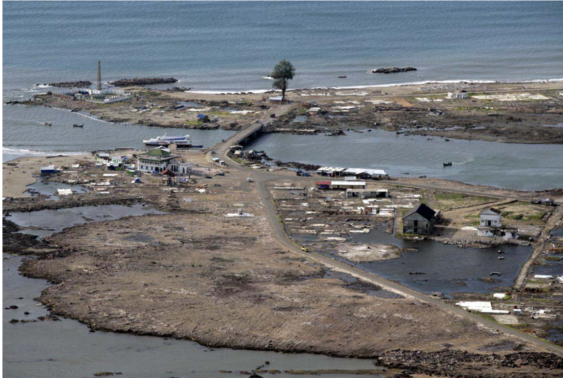
Photo 1. Damaged areas of Aceh

The contribution of cadastral reconstruction to the redevelopment of the affected areas post disaster is evident at all levels and sectors. However, exercising the cadastral reconstruction in these areas is far beyond simple due to the shortage of survived land-owners and of information related to each land parcel.